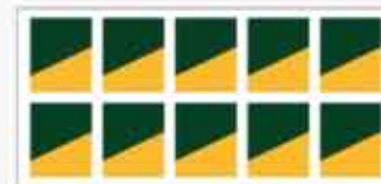
Rectangles: 18" X 24" 10 Decals per sheet