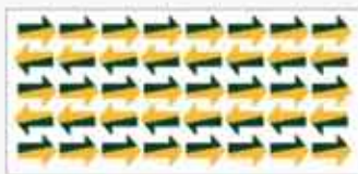
Arrows: 16" X 6.5" 40 Decals per sheet