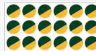
Circles: 16" 18 Decals per sheet