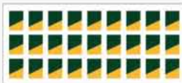
Rectangles: 10" X 14" 27 Decals per sheet

See below for all size configurations and decal quantities per sheet.