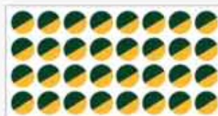
Circles: 12" 32 Decals per sheet