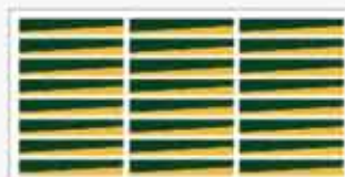
Strip: 36" X 5" 24 Decals per sheet

Rectangle decals can be oriented either vertically or horizontally on a sheet depending on the design.