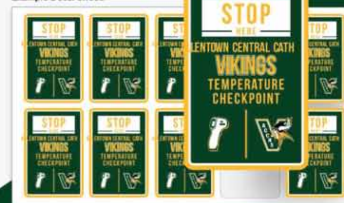
Example Decal Sheet:

Rectangle decals can be oriented either vertically or horizontally on a sheet depending on the design.