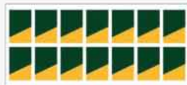
Rectangles: 12" X 18" 14 Decals per sheet