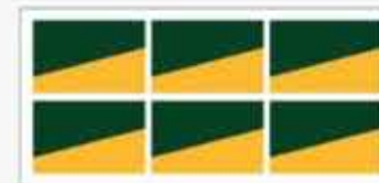
Rectangles: 24" X 36" 6 Decals per sheet