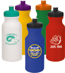
20 oz. Water Bottles with Push Cap